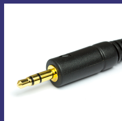
3.5mm for laptop & mobile