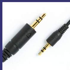
2.5mm for desk phones