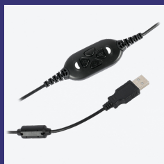
USB for desktop & laptop