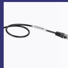
RJ-09 jacks for desk phones

Visit our website at www.dasscom.com for more information.